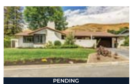
1143 SANDERS DRIVE, MORAGA 3 BD. 3 BA. 2.113+/- SF OFFERED AT $1,249,000