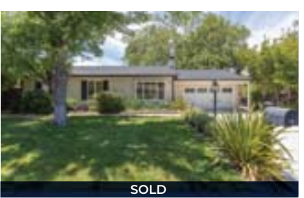
85 MONTE CRESTA AVE., PLEASANT HILL 3 BD, 2.5 BA, 1,833+/- SF SOLD FOR $1,036,000 CO-LISTED WITH SHELLEY RUHMAN