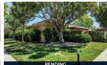
2233 PINE KNOLL DR. #1, ROSSMOOR 1 BD, 1 BA, 842+/- SF OFFERED AT $325,000 CO-LISTED WITH SHELLEY RUHMAN