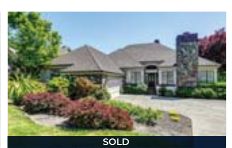
18 HARRINGTON ROAD, MORAGA 3 BD, 2 BA, 2,235+/- SF SOLD FOR $1,390,000