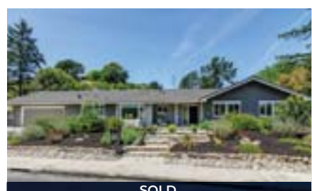
217 CORLISS DRIVE, MORAGA 4 BD, 2.5 BA, 2,357+/- SF SOLD FOR $1,570,000